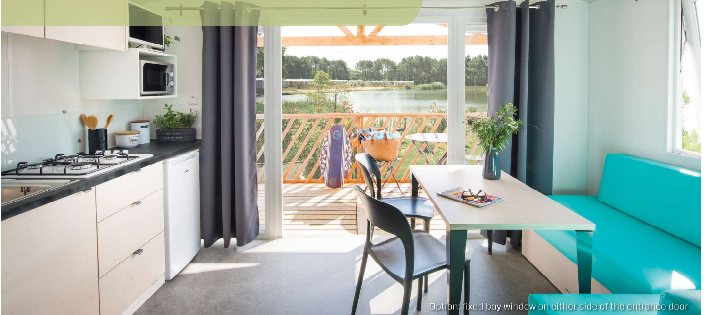
Option: fixed bay window on either side of the entrance door