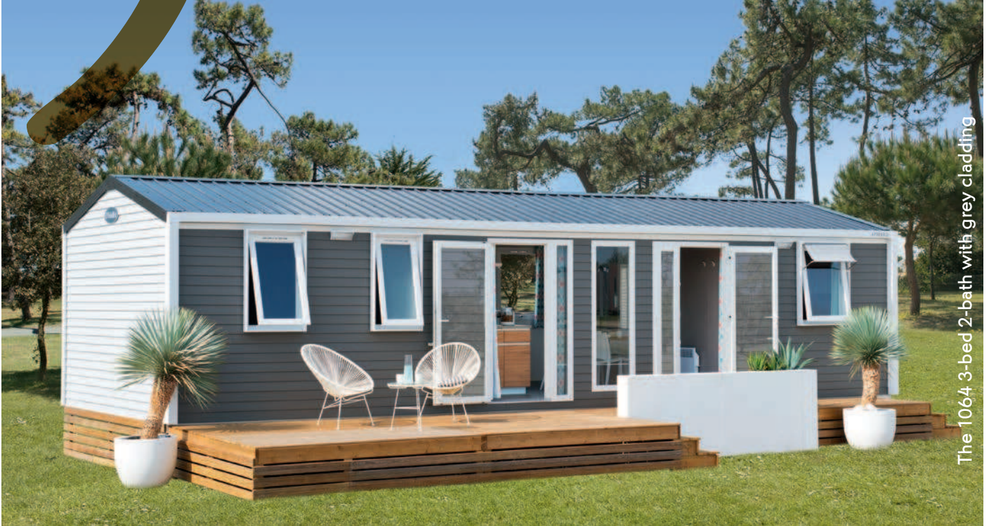
The 1064 3-bed 2-bath with grey cladding